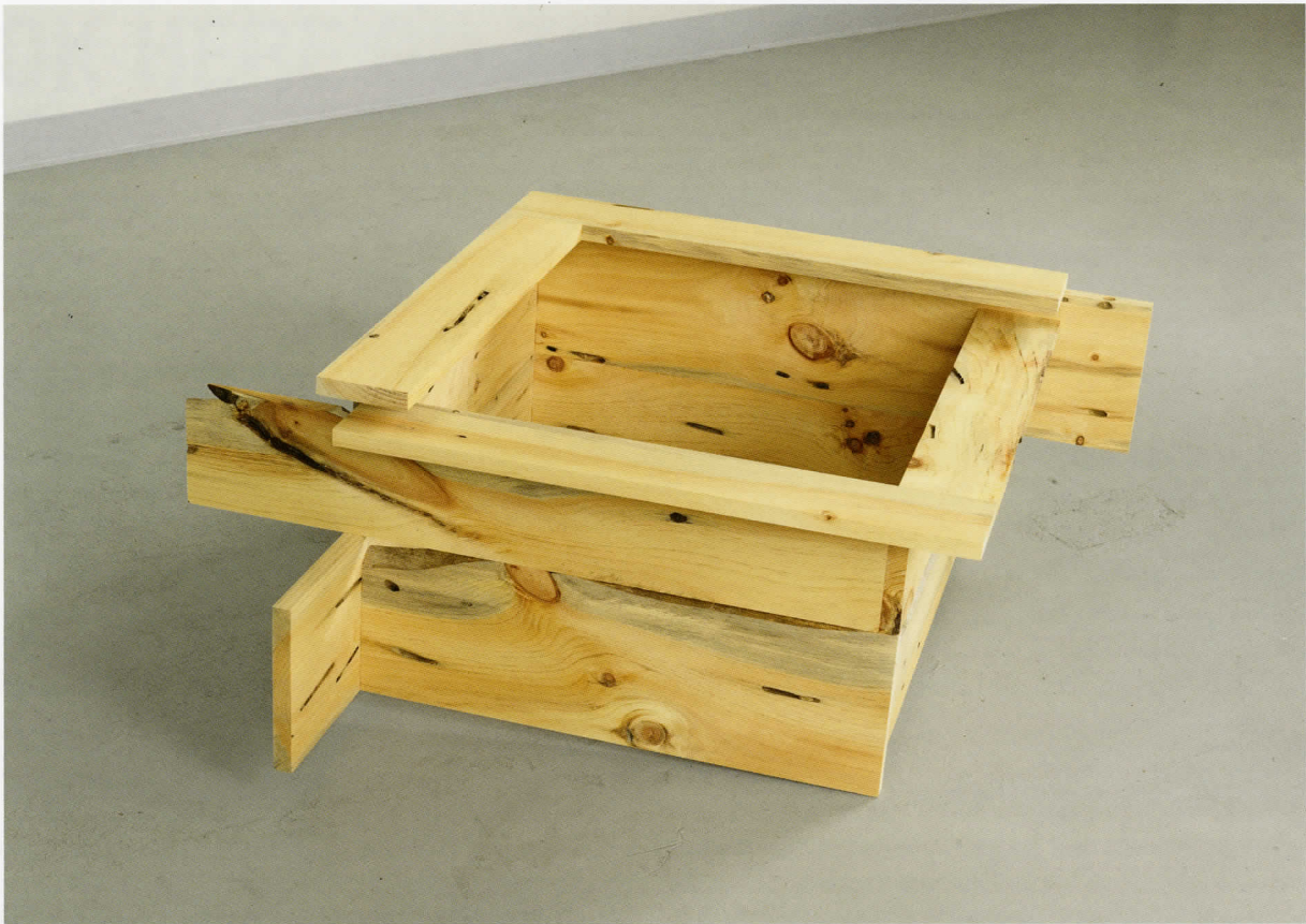
Taylor Davis, WHITE PINE 3 , 2010, (extended diamond), white pine, 17" x 43" x 43."