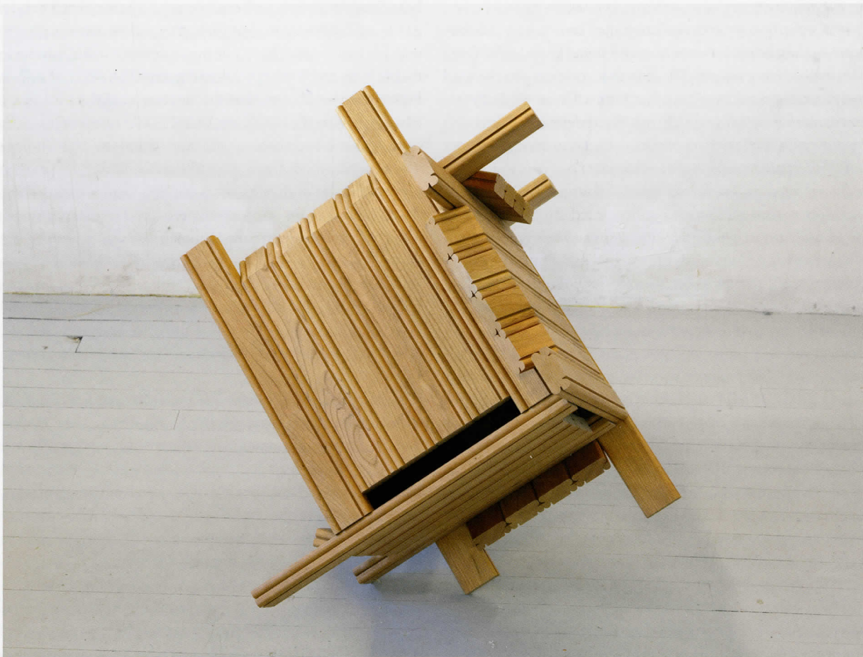
Taylor Davis, Fingers and Thumbs #3 , 2014, Cherry wood, 39" x 39" x 39."