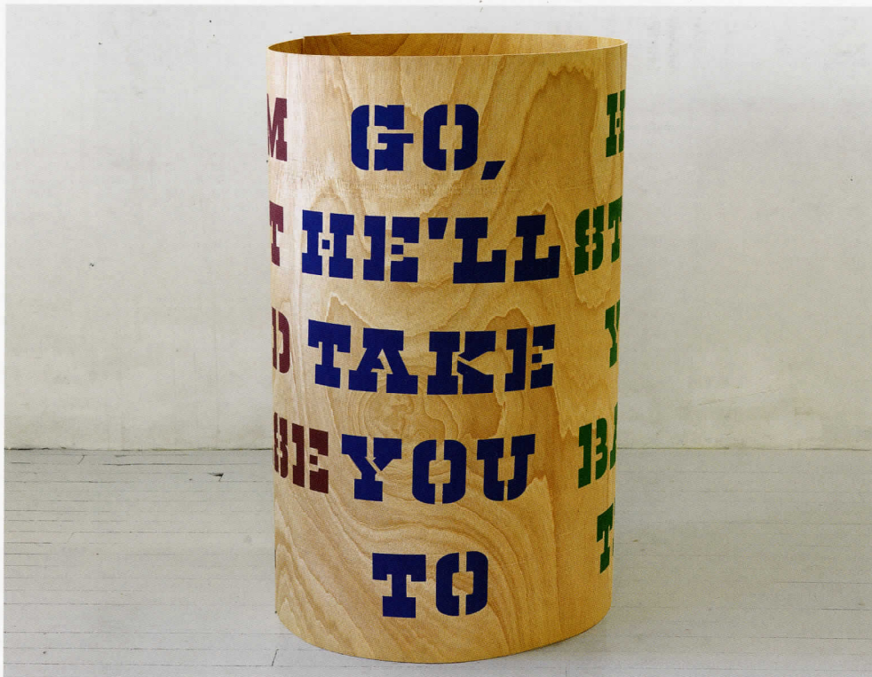
Taylor Davis, If you steal a horse , 2014, Wacky wood and oil paint, 47 1/2" x 29" x 27."

in a corner of the gallery—is a dark horizontal read, a single perspective of lustrous words partially visible in the folds of the suede. It has weight and stillness that allow a moment of rest. Plus “exhausting period of logical and analytical thought” is funny when read in relation to the sometimes laborious “viewing” of the cylinders.